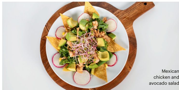
Mexican chicken and avocado salad

Hokey pokey ice cream, caramel sauce topped with cream, pineapple lumps, chocolate fish and gingernut crumble $8.50