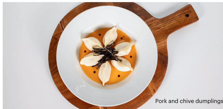
Pork and chive dumplings

☑ all our eggs are free range | v = vegetarian | ve = vegan | gf = gluten free | df = dairy free