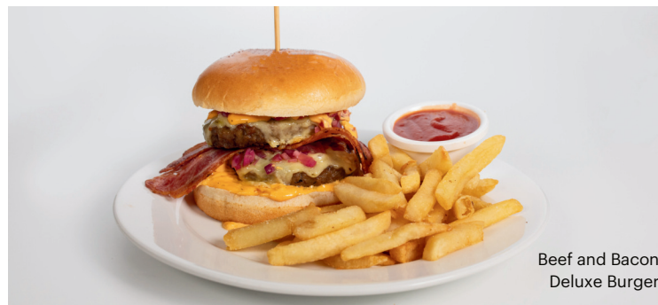
Beef and Bacon Deluxe Burger